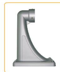
Wall-mount Bracket WMB-J909