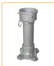
Pendant Bracket PMB-J902