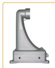
Wall-mount Bracket with Power Box WMB-J908