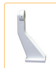
Wall-mount Bracket WMB-J912