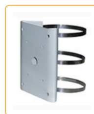
Pole-mount Bracket PMB-J903