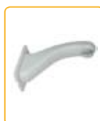
Wall-Mount Bracket WMB-D102