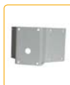
Corner-Mount Bracket CMB-D103