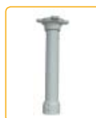
Pendant Bracket PMB-D101