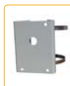
Pole-Mount Bracket PMB-D104