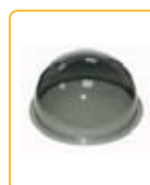
Smoked Dome Bubble SDB-D01