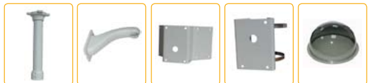
Pendant Bracket PMB-D101